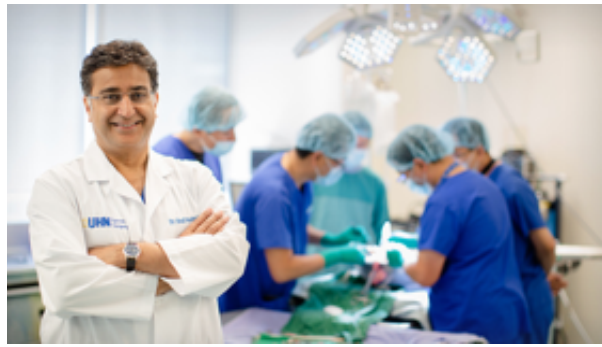
Historic Funding to Transform Transplant Research /read more