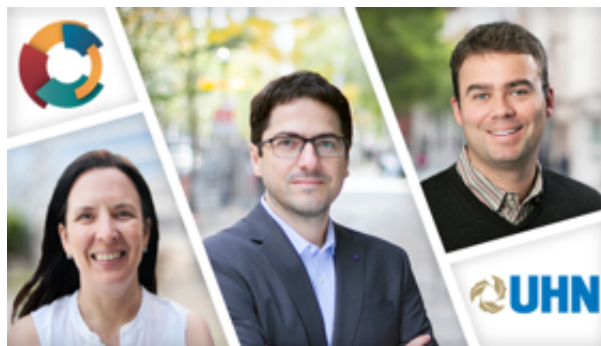
Canada Research Chairs Funding Awarded /read more